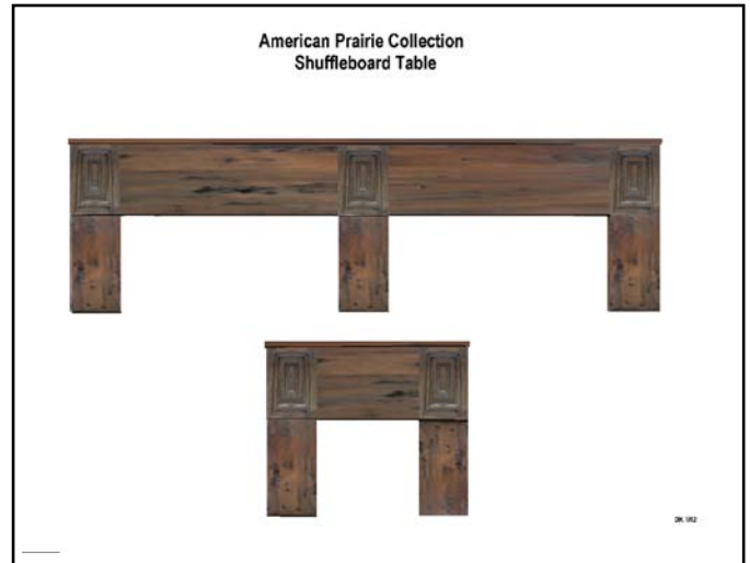
Original Shuffleboard Concept Sheet