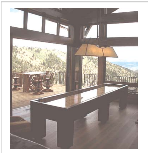
12' Shuffleboard Table in New Design

All currently offered games and other products will be available in this new collection.